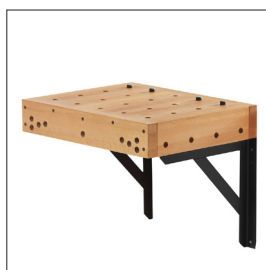
Sjöbergs Clamping Platform Art nr 33467