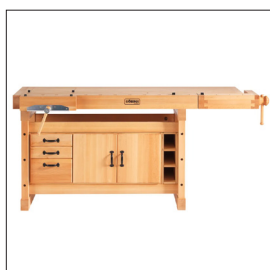
Sjöbergs Original 1900 + SM05 Art nr 35008