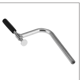
Holdfast ST03 Art nr 33637