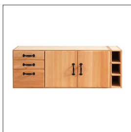
Sjöbergs SM05 Art nr 33818