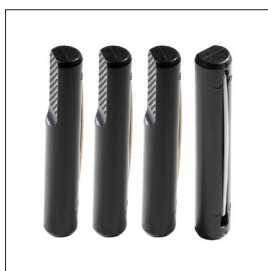
Bench dogs, round Art nr 33290