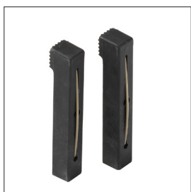
Bench dogs, square Art nr 33291