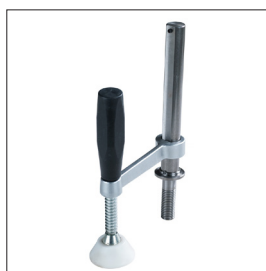
Holdfast ST11 Art nr 33639