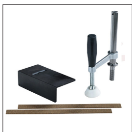
Accessory kit Original 1900 Art nr 33829